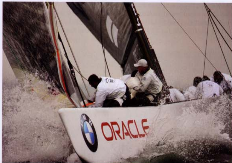
BMW Oracle Racing rounding a mark during Act 6 of the Louis Vuitton Cup.

For more information on the team of BMW Oracle Racing, please visit www.bmworacleracing.com