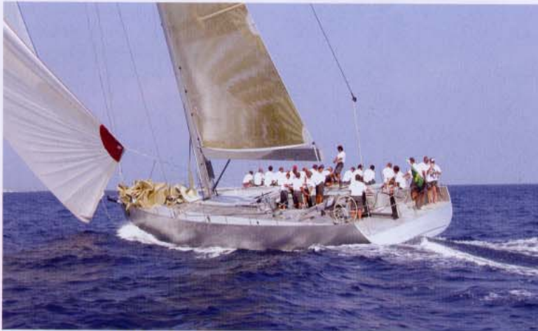
ROMA on her way to win the Maxi Yacht Rolex Cup 2005.

ROMA , built from our Design #535 drawings, is an 85 foot fast cruising yacht intended to race and cruise with equal effectiveness. Commissioned by Filippo Faruffini, Farr Yacht Design's scope of work was for a comprehensive design package including structural detailing and several construction site visits.