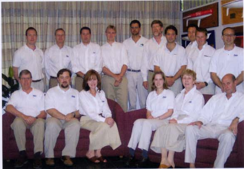
"Have a speedy and safe voyage", from all of us at Farr Yacht Design.

To all boats in the race we wish a safe voyage.